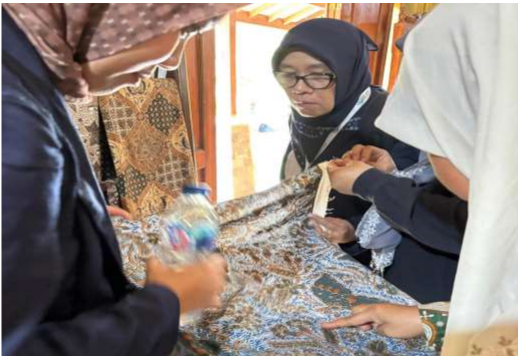
Picture 6. The characteristic pattern from Batik Wukirsari

The gallery team has a policy of making batik with the Shir Gung Gung pattern which depicts shrub leaves as the basic ingredient of guruh tea. Therefore, the craftsmen are asked to produce the pattern as a characteristic of batik in Wukirsari.