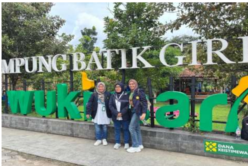
Picture 8. The main gate of Kampung Batik Giriloyo