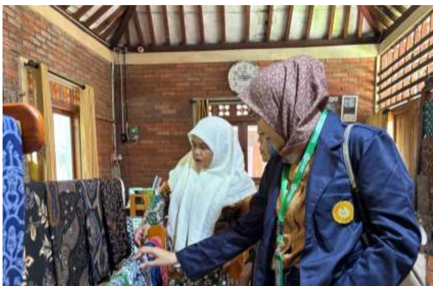
Picture 2. The hand drawn batik display