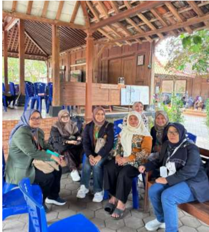
Picture 7. Small Group Discussion with one of the union management

The arrangement of schedules and governance practices so that the potential for the development of batik cooperatives will be more measurable and cooperative members will have clearer accountability.