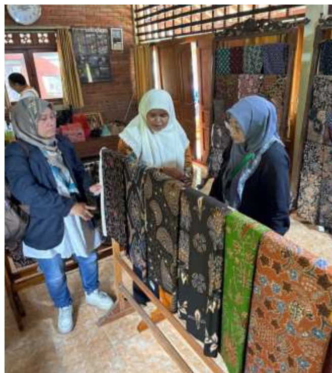
Picture 5. Gallery as a showroom of the hand drawn batik

The members of the batik unions are 86 people, all of whom are not batik craftsmen or batik owners, but also traders and other women who want to be active in developing Wukirsari Village. However, each member of the unions from batik craftsmen is required to make at least one batik in a year to be exhibited in the village gallery, which is near Pendopo Giri Loyo. Producing hand drawn batik takes quite a long time, one piece of batik can be completed in approximately two months because Batik Giri Loyo is known as a traditional batik that uses wax as an auxiliary material. On average, each unions member who has batik products and a showroom is able to produce fifty batik cloths with the same design and products according to the requirement of the unions management in the gallery section. The results of these products are exhibited in the pendopo gallery.