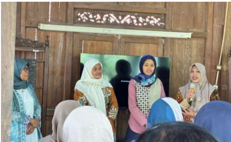
Picture 3. Part of the management of Batik Giriloyo union

In the beginning start, Unions was formed from members of the association led by 12 people who had batik products, including batik products with the names: Sri Kuncoro, Sekar Arum, Giri Indah, Suka Maju, Sungging Pile, Sungsang, Sido Mukti, Giri Canting, Berkah Lestari, Sekar Kedhaton, Bima Sakti and Batik Giri Loyo. The Batik association initially had their own showrooms. However, because all batik associations wanted to enhancing Wukirsari Village and providing activities for other women, various associations joined the unions and becaming administrators in the unions and actively intriduced the Batik Giri Loyo Unions as a batik tourism destination centered at the Pendopo Batik Giri Loyo.